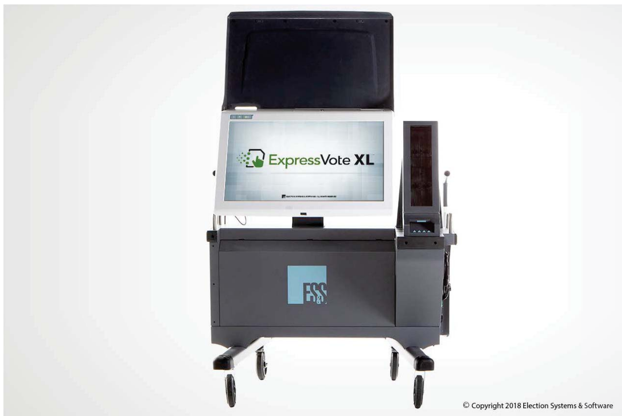
Fig. 1 ExpressVoteXL (Px 1012.)

The machine is reliable and easy to use. It is a hybrid device, combining ballot-marking and tabulating/scanning functionalities within a single system. (2/18/20 Tr. 105:1–6; 2/19/20 Tr. 186:22–187:6.) The voter first inserts a blank card into the slot to the right of the screen; this prompts the XL to load the appropriate ballot, which appears on the 32-inch touchscreen. (2/19/20 Tr. 186:25–187:6.) After she makes her selections, the machine prints them, producing a summary card: